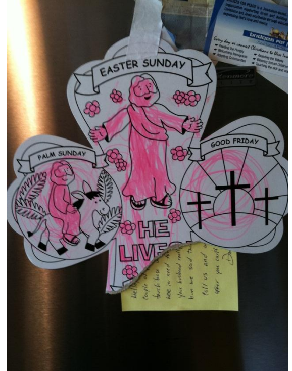
Figure 8 - Zoe's artwork – Pink is her favorite color