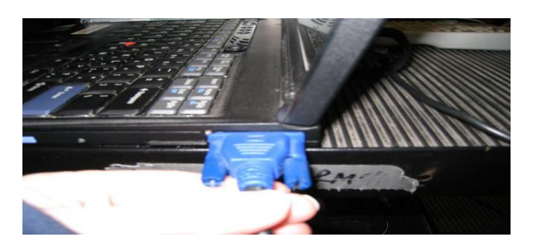
Step 5: Turn the LED projector and the computer on. Through either the projector remote or the controls on the projector itself, select the input device to be used (computer).